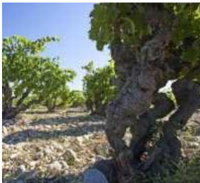
gnarly old vine growing on the stones at Sang Des Cailloux

Back in the early 1990's in recognition of the unique richness and quality of it's wines, the Cote du Rhone village of Vacqueyras received its own appellation status. During those days American Importer Kermit Lynch from Berkeley was building what has become the source for some of the best traditional wines from Southern France. Focusing on passionate and dedicated producers and realizing the fabulous quality that can be archived, Kermit built one of the finest imported portfolios by signing up some of the best producers, amongst them Tempier in Bandol, Vieux Telegraph from CNDP and Sang des Cailloux in Vacqueyras. Over the years these wines became household names with US wine collectors.